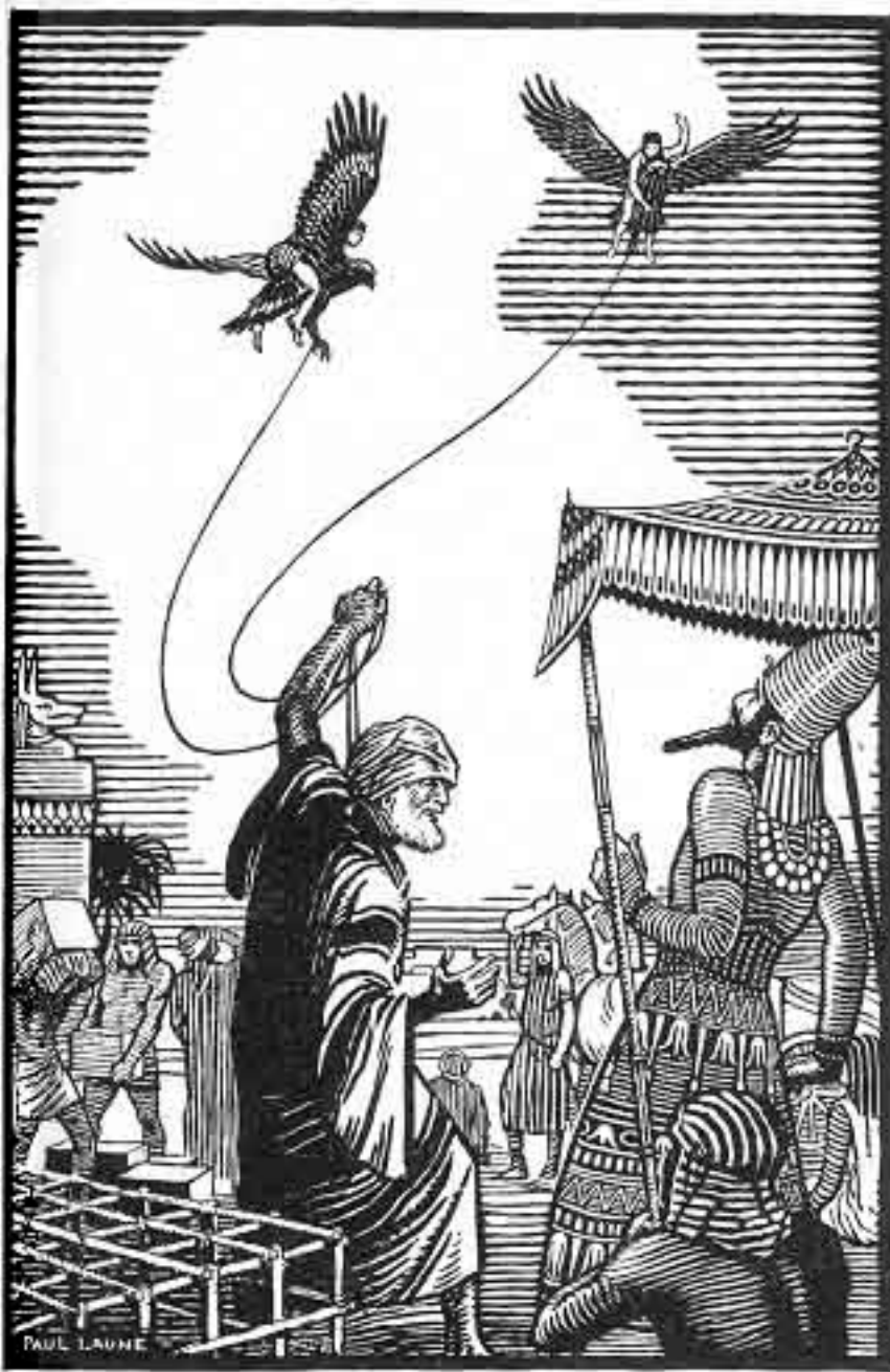
AHIKAR ANSWERS PHARAOH'S RIDDLE